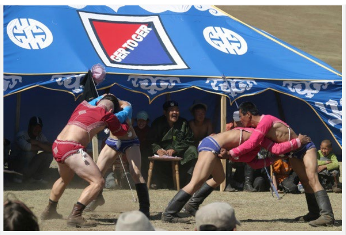
Visitors and locals watch Mongolian-style wrestling during a naadam (traditional Mongolian festival). The sport is somewhat similar to Greco-Roman wresting: the first man to touch the ground with anything but his feet loses, there are no weight classes and no time limits. The tradition two-piece costume consists of a tight-fitting vest (zodog) and shorts (shuudag).

It is this successful marriage of socio-economic development and commerce that gave them the edge over 610 other worthy entries from 80 other countries and saw them get shortlisted as a finalist in the 2009 Geotourism Challenge and then take top honours in the other two associated prizes – the inaugural Urban Adventures Prize and the Tourdust Scholarship.