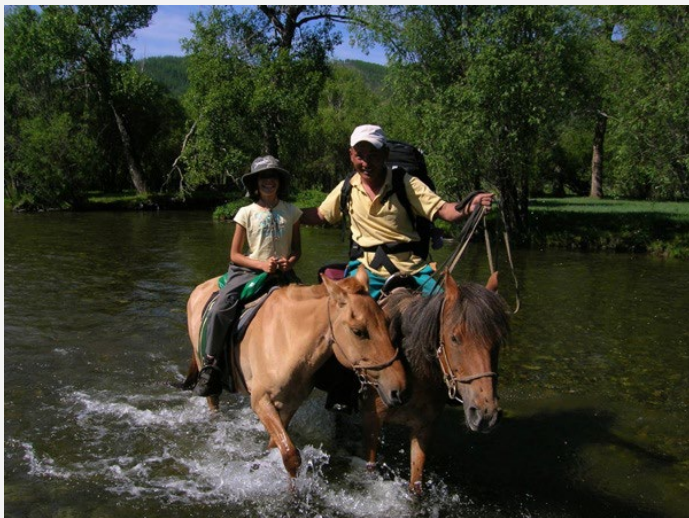
A visitor and guide cross the Tuul River in Terelj National Park, Mongolia, while moving along a nomadic travel route. Ger to Ger trips move by horse, ox cart, camel and foot, so that you can really sense the land, the people and the traditions.