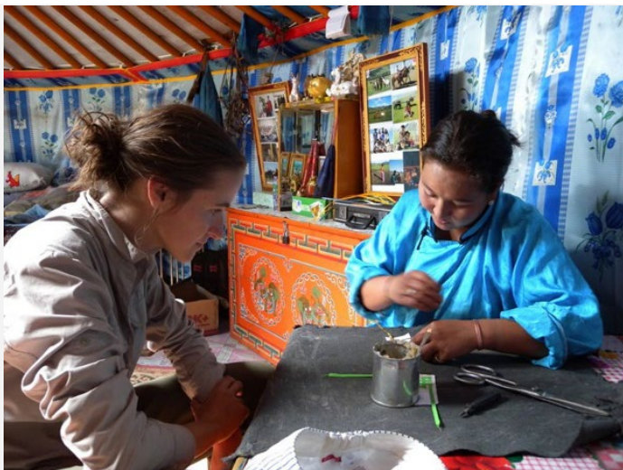
On a Ger to Ger cultural homestay program in Mongolia, visitors live and learn with rural communities and nomadic families. Here, inside a typical ger, a visitor learns how to sew with a nomadic woman in Terelj National Park. Other common activities include nomadic naadam (festivities), training Kazakh eagles, learning horse-head fiddle and more.