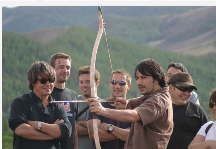
At a naadam (traditional festival) in Tereelj National Park, Mongolia, travellers try their hand at archery and can even compete with locals. Local men shoot at targets 75 meters away and women from 65 meters, although, for visitors, distances can be set according to ability.